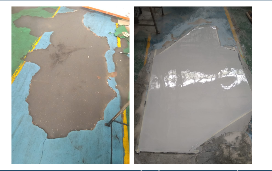
گ Damaged Concrete Floor Rebuilt with Duromar DuroFil Protected with Duromar DF-1310